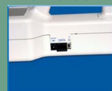
Easily Download Data to PC