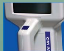
One-handed Operation with Start & Stop on Handle