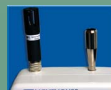
Removable Temp / RH and Isokinetic Probes