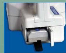
Removable Rechargeable Li-Ion Battery